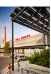
The building's design is a blend of modern and industrial aesthetics.