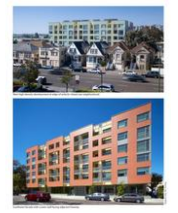
TOP: New high-density development at edge of eclectic mixed-use neighborhood; BOTTOM: Southwest facade with screen wall facing adjacent freeway

North and South Elevations