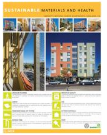
Sustainable materials signage located in the building lobby

Multiple design strategies model respect for natural resources and achieve healthy living spaces.