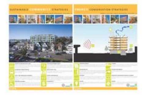
Sustainability educational signs that are located in the building lobby. - Photo Credit: Architect

Merritt Crossing Senior Apartments is a product of the social mission of Satellite Affordable Housing Associates (SAHA): Rewriting the rules of affordable housing by providing affordable, service enriched housing that promotes healthy and dignified living for people with limited options.