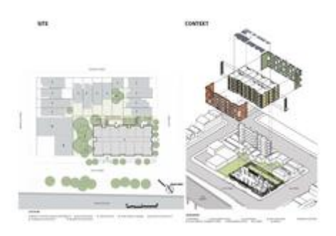
Site and Context Plans -Photo Credit: Architect