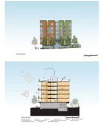
East Elevation and Cross Section - Photo Credit: Architect