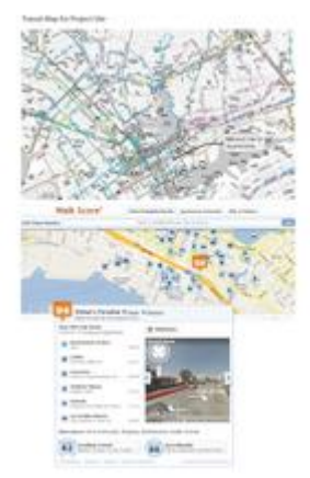
TOP: Transit map BOTTOM: Walkability/Transit/Cycling Score

Merritt Crossing Senior Apartments provides critically needed affordable housing and on-site services to low income seniors in the Chinatown neighborhood in downtown Oakland. Many of the residents were challenged by homelessness and physical or mental illness. As an infill development, it transformed a vacant property into a community asset.