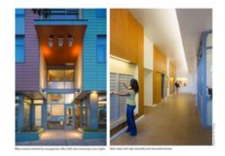
LEFT: Main entrance flanked by management office and community room; RIGHT: Main lobby with high-durability and renewable finishes