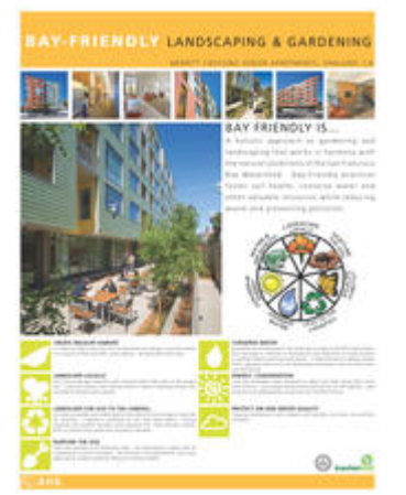
Bay Friendly educational signage located in the building lobby

Located in mixed neighborhood in downtown Oakland, the site for this project was a vacant lot that was a gas station at one time. The site is adjacent to both residential and commercial properties and is across the street from a major urban elevated freeway. The existing ecosystem was poor.