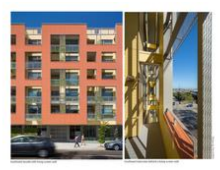
LEFT: Southwest facade with living screen wall; RIGHT: Southwest balconies behind a living screen wall