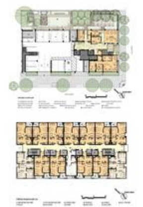
Floor Plans - Photo Credit: Architect