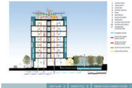
Measure 6 - First Image - Photo Credit: LMS Architects

Programmatic requirements resulted in the building covering the entire site. Storm water is managed through detention as San Francisco has an aging combined storm and sanitary sewer system. A large detention tank is located below the ground floor courtyard to help manage storm water surges. The extensive green roof also contributes to rain water retention.