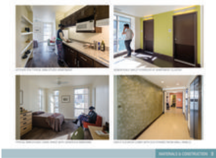
Measure 8 - Second Image - Photo Credit: Tim Griffith

The criteria for material selection for Rene Cazenave Apartments was based on the special needs of the residents and the non-profit owner/operator who has extensive experience with supportive housing. Healthy properties, high durability, ease of maintenance and energy efficiency were all critical aspects for materials. The non-profit owner will be operating the building for decades to come within a limited operating budget.