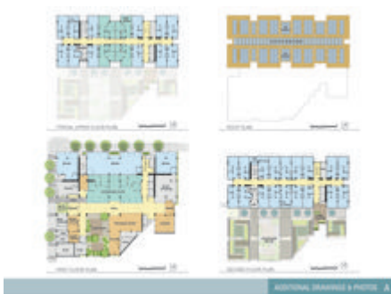
Additional Images - First Image - Photo Credit: LMS Architects