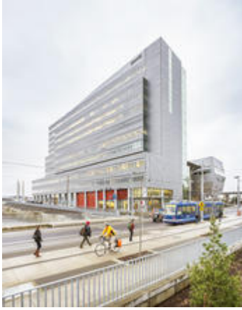
CLSB is located at the entry to OHSU's new Schnitzer Campus and is well served by a variety of transportation modes.

Having three institutions collaborate to deliver a single building helped to greatly increase efficiencies and reduce the environmental impacts inherent in new construction. CLSB's connection to public transit and a web of bike and pedestrian trails significantly reduces parking demands and contributes positively to improved air quality.