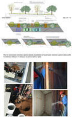
A computer rendering explains the stormwater retention system (above). Photos show installation of the stormwater system and blown-in cellulose insulation.

100% of storm water is captured on site. Most of the water is captured by the green roof and is returned to the groundwater after being cleaned of pollutants. All other storm water is collected in a subsurface infiltration system.