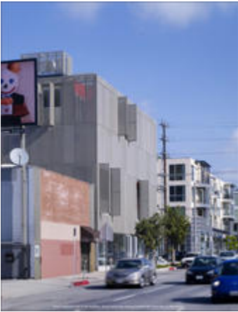
The photo shows the eastern street view of the building along Fairfax Avenue.