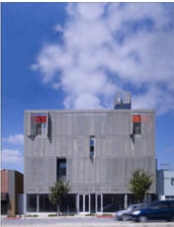
The main entrance, including retail frontage on the first floor, can be seen in this photo.