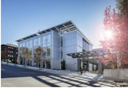
North elevation from Ridge Road