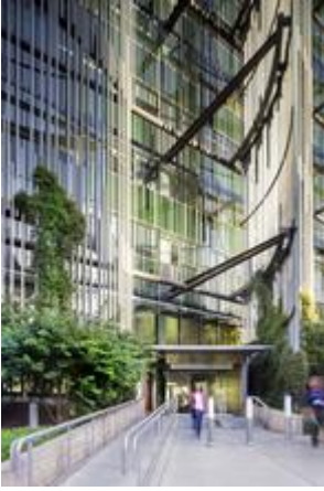
The building's west-facing reeds filter the sun's rays and host a variety of native deciduous vines.

The most prominent feature of EGWW are the staggered vertical “reeds” on the west façade, which not only shade the building, but support a native ecosystem. A tapestry of climbing vines ascend the reeds, connecting the building to the ground plane and surrounding landscape – a lush arrangement of plants selected from the bio-region for their qualities of beauty, drought tolerance, soil adaptability, and compatibility with security guidelines. The deciduous vines also allow extra light into the building during winter; in autumn they provide a pop of color.