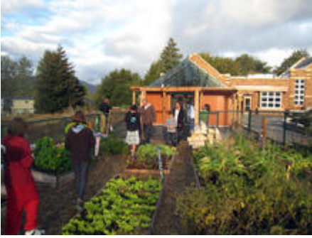
Students learning in outdoor garden classroom

Design of the site combines low-water, native vegetation, which populates 18,100 sf—nearly all of the landscaped area surrounding the project. The building footprint was minimized to allow 21,560 sf of vegetated open space to be preserved.