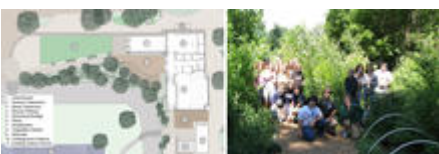
Site Usage Diagram (left), students maintain a low-water, native vegetation garden (right)