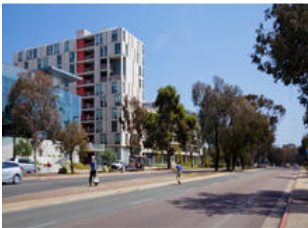
View looking south on Torrey Pines Road