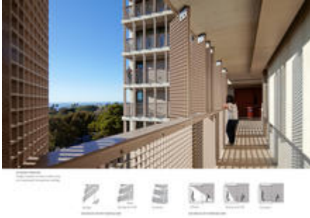
Single loaded corridors for passive cooling