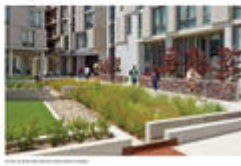
Stormwater management and habitat creation