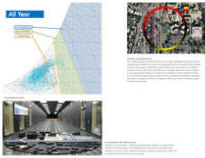
Psychrometric, wind and solar analysis informed the design