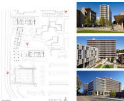
Site Plan and views