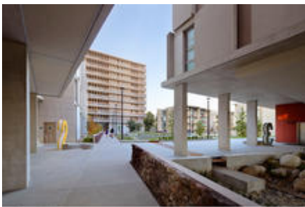
View entering plaza from the south