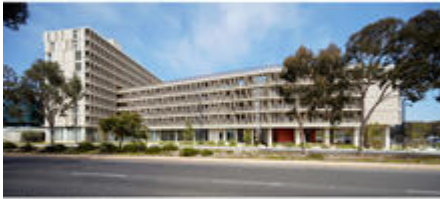
View of west facade from Torrey Pines Road

The Charles David Keeling Apartments are located on the southwestern edge of the UC San Diego campus overlooking the coastal cliffs of La Jolla. Named for the scientist whose research first alerted the world to the possibility of the human impact on global atmospheric carbon, the apartments employ a suite of tactics to address Southern California's pressing environmental challenges of stormwater management, water scarcity, and carbon emissions.