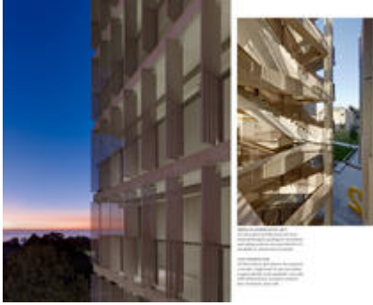
Materials and Construction - Photo Credit: Tim Griffith

Materials used in the building are robust and long-lasting, with an 80-year life span. In addition, most surfaces are unfinished, eliminating the need for carpet, vinyl tile, or mastics.