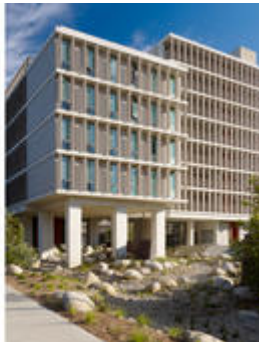
Bioremediation via green roof and bioswales

Rain events at UC San Diego are infrequent, but are often dramatic downpours that produce high volumes of runoff which, from this position atop the Pacific coastal bluffs, cause erosion to the fragile coastal scrub arroyos, a particularly threatened ecosystem. To counter this damage, the apartments use the natural slope of the site to provide limited natural infiltration, reducing the quantity of water and increasing the quality of the water released into the ocean. Water from the roof and a nearby parking lot is channeled and daylight through retention basins and bioswales.